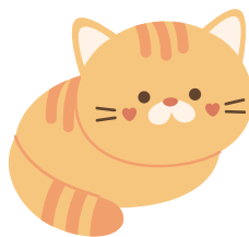
c a t