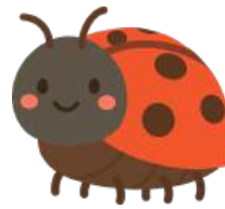
b u g