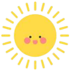
s u n