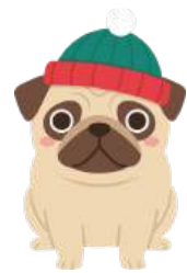
d o g