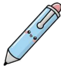
p e n