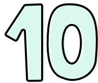
t e n