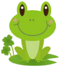
fr o g