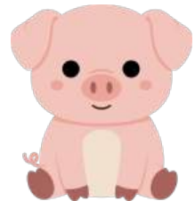
p i g