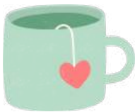
c u p