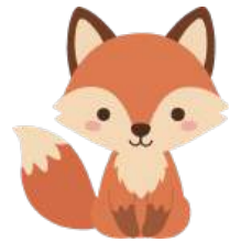
f o x