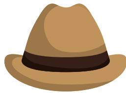
h a t