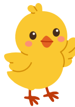
ch i ck