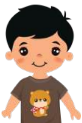
k i d